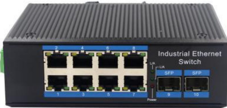
2*GE SFP Fiber+8*GE Copper Unmanaged Industrial Ethernet Switch Size: 143.7*103.8*47.7 mm, DIN Rail-mounted