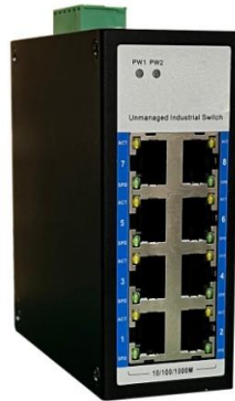
MES-308: 8*GE Copper Unmanaged Industrial Ethernet Switch Size: 103*100*41mm(mini type)